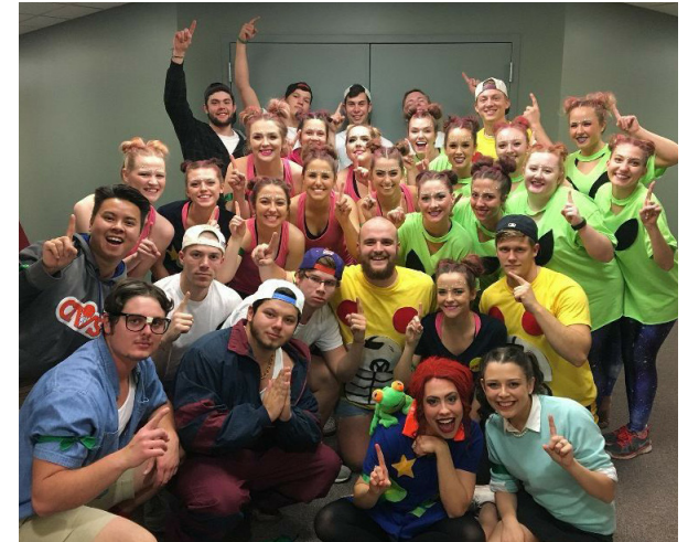
Xi chapter members and the ladies of Sigma Sigma Sigma after a first-place win at the Greek Week Lip Sync.