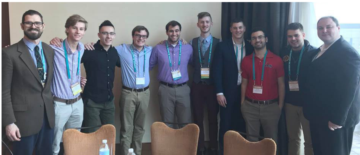
(Right) Both undergraduate and alumni members of Alpha Kappa Lambda well represented from 5 different chapters at the Association of Fraternal Leadership & Values Conference (AFLV.)