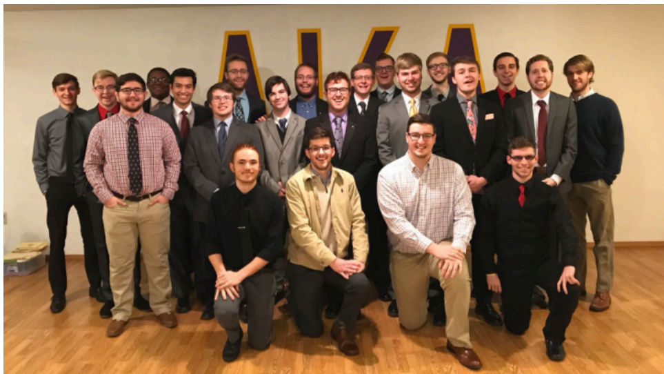
(Above Left) Lambda Chapter at Emporia State University celebrating the initiation of their newest members.