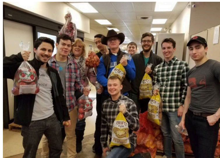
(Above Right) Mu Colony members of the Ohio State University volunteering at the LSS Champion Food Pantry.