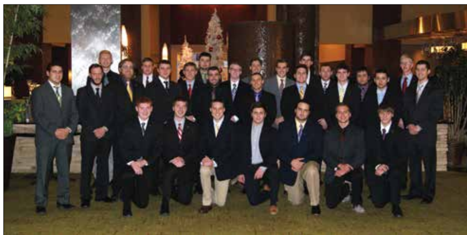
Chapter presidents attended the President's Academy in Carmel, Indiana, in January.

This year, the curriculum had an increased focus on scholarship as well as proper social media usage, OmegaFi chapter financial management training and crisis management. Each president