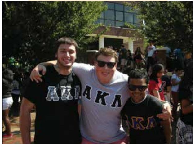
Beta Nu Brothers are some of the undergraduates benefiting from Alethia Scholarships.