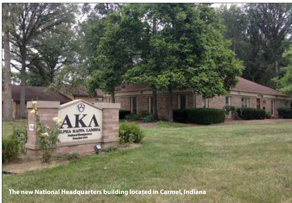
The new National Headquarters building located in Carmel, Indiana

The National Headquarters has an open door policy for all brothers who wish to visit and tour the building while in the area. To schedule a visit, contact the office at 317-564-8003.