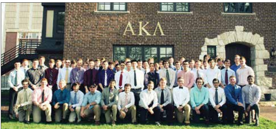
Gamma Chapter members at the University of Illinois in front of their newly renovated house

Academically, Delta has implemented an individual tutor program to ensure that brothers reach their full potential. Membership and recruitment is at an all-time high. The active membership now sits at more than ten times the colonization