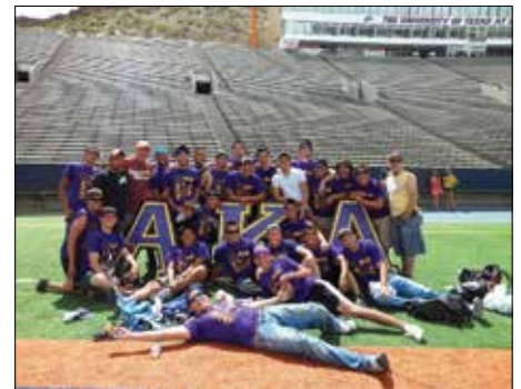
Members of Alpha Rho at the University of Texas El Paso