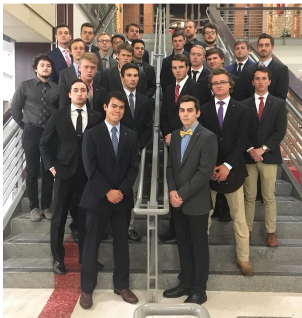
Left: The Mu Colony at the Ohio State University practiced Recruitment 365 to continue growing.

Below: Gamma Beta at Alabama volunteering for The Culverhouse School of Accountancy LIFT program.