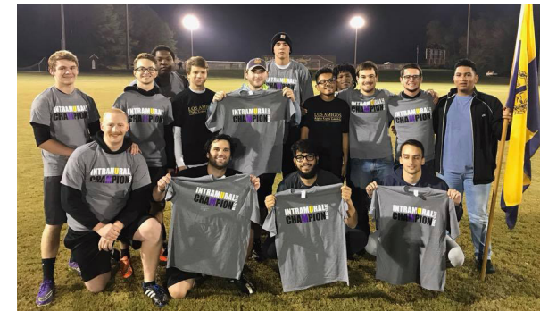
Above: Gamma Delta at Montevallo, celebrating as Intramural Champions.