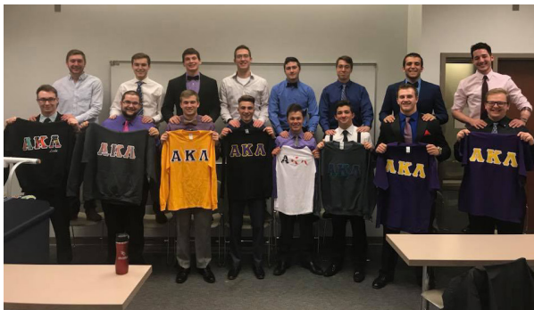
Above: SVSU Colony Members celebrating the Fall 17 colony pledge class completing their ALPHA Experience New Member Education Process.

Below: SVSU Colony volunteered at Saginaw-Shiawassee Habitat for Humanity by sorting the wood room. The chapter said "it was an incredibly enriching experience and we had a lot of fun doing it!"