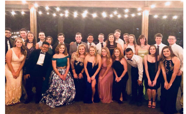
Brothers of our Gamma Delta Chapter at the University of Montevallo celebrating the end of the semester.