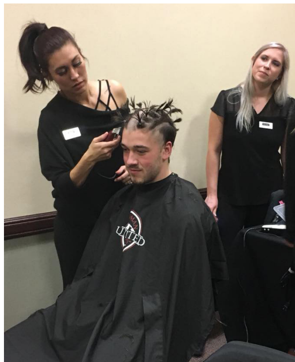
Above: A brother from our Gamma Theta Chapter, at Boise State University, participating in their AKA Haircut Auction. $5 Holiday Haircuts were also available by Paul Mitchell Hair Salon. All proceeds benefited the Women's & Children's Alliance.