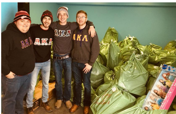
Below: Members of our Saginaw Valley State University Colony spent a Saturday morning assembling Salvation Army gift bags for families in need.