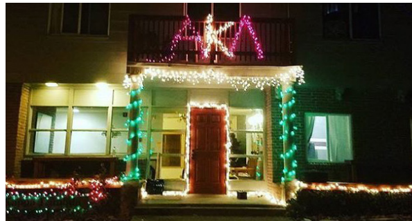
Our Alphi Phi chapter house at the University of Idaho feeling festive for the holiday season.