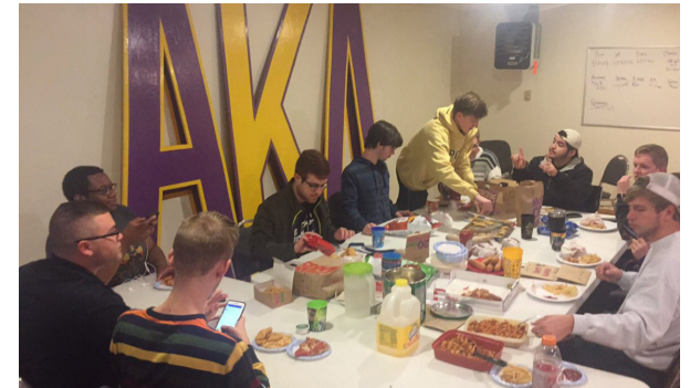
Lambda Chapter at Emporia State University celebrating their "College-Giving" brotherhood dinner.