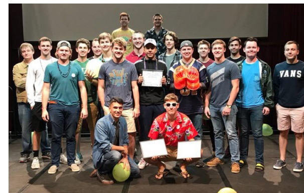
Above: The chapter celebrated as the overall winner for SIUE's Make a Wish Philanthropy.