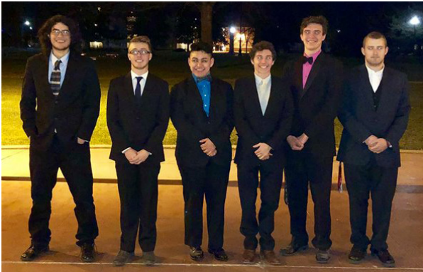
The newest initiated members of our Upsilon Chapter at the University of Northern Colorado.