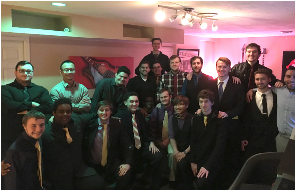
Our Beta Chi Chapter at George Mason University initiated nine new members. Congratulations!