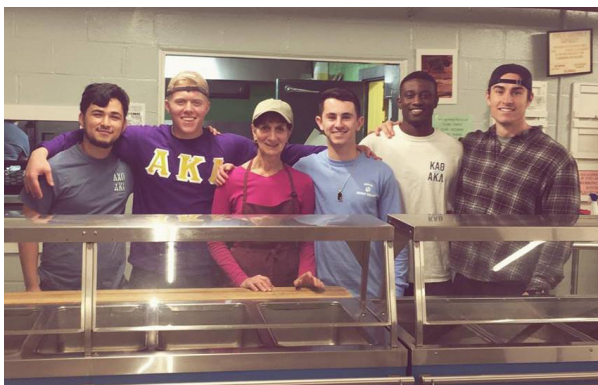
Above: Brothers of our Gamma Pi Chapter at the University of Connecticut took a break from studying to volunteer at a local Soup Kitchen in Willimantic, CT.