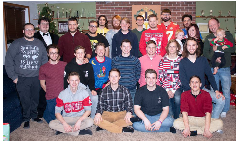
(Bottom Right) Happy Holidays from Psi Chapter at Iowa State University!