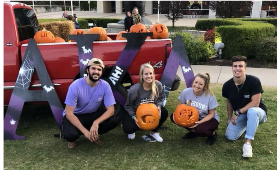
(Top Right) Beta Psi Chapter at Missouri State University raised almost $1,000 for Harmony House at their annual pumpkin carving.