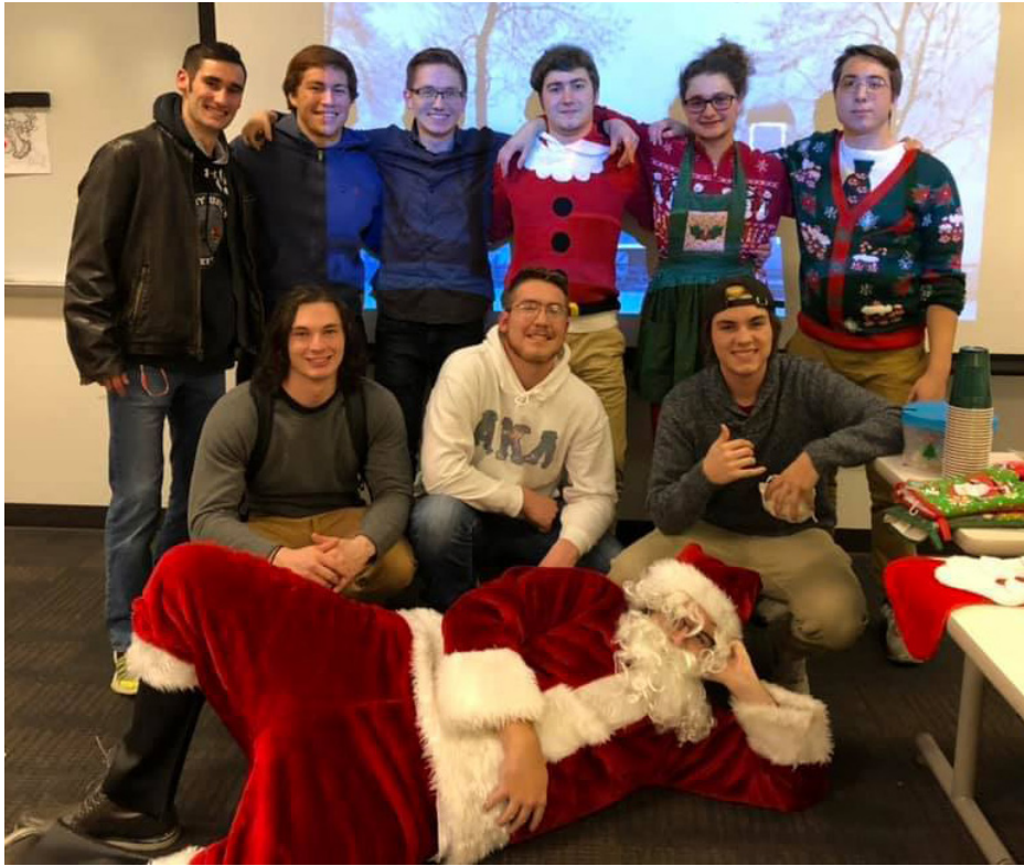
(Top Left) Gamma Upsilon Chapter at Saginaw Valley State University co-hosted "Christmas in November" with the women of Alpha Sigma Alpha. The holiday-themed social event raised money for various organizations including the Special Olympics, the Underground Railroad, Girls on the Run, and the Alpha Sigma Alpha Foundation.