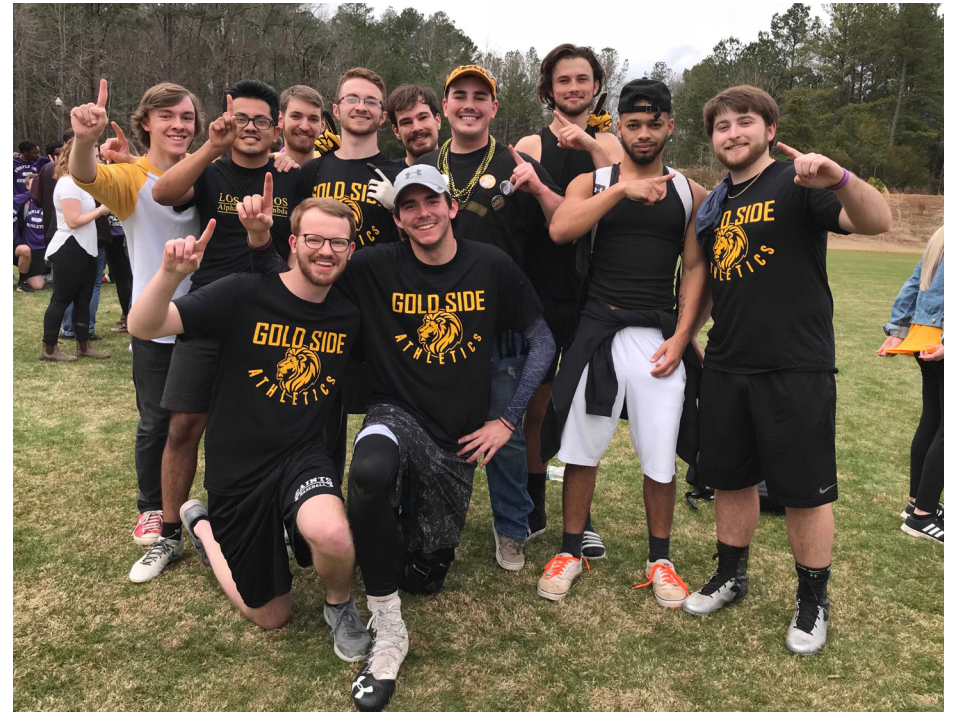
Gold Side and AKL brother celebrate another Ultimate Frisbee win.