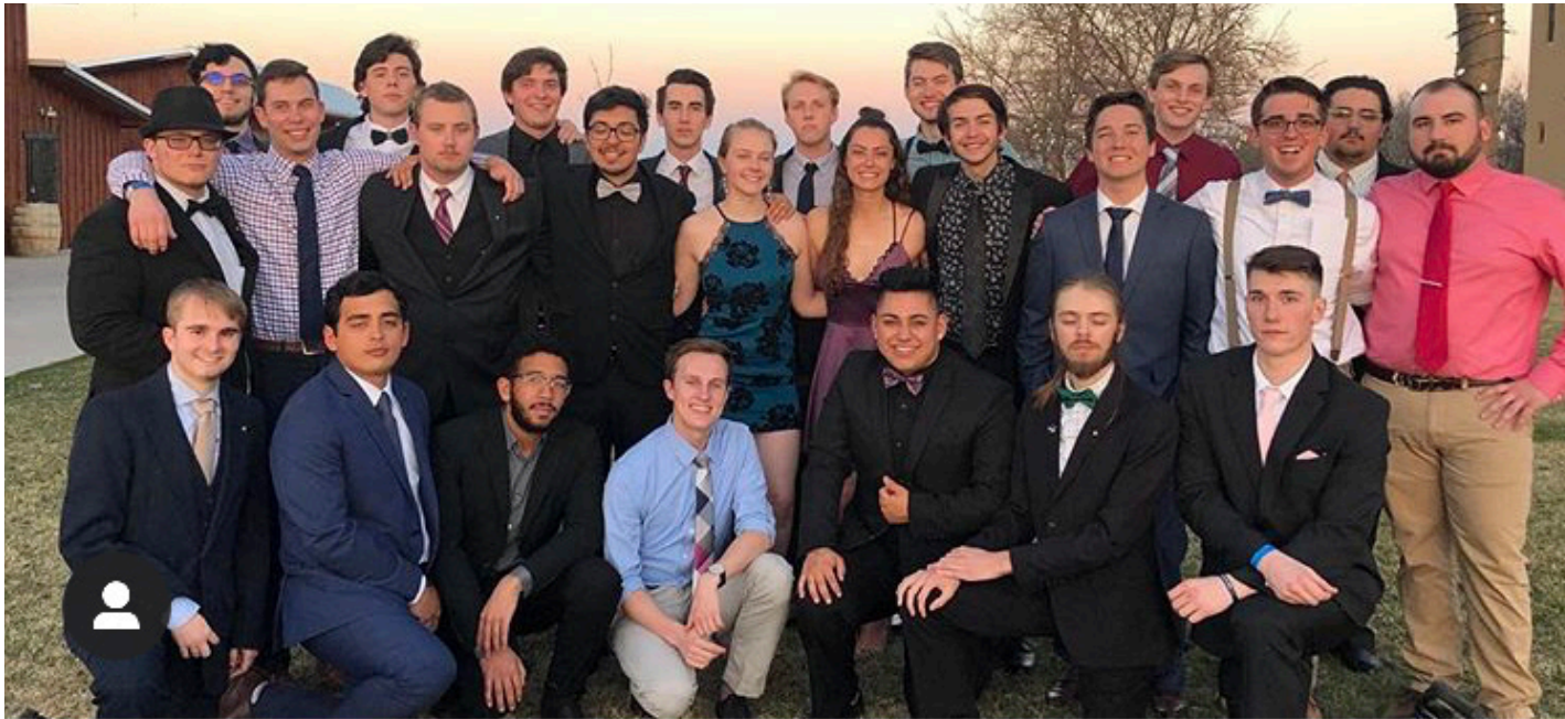
(Left) Upsilon Chapter at the University of Northern Colorado celebrate the end of another semester with their Yellow Rose Formal.