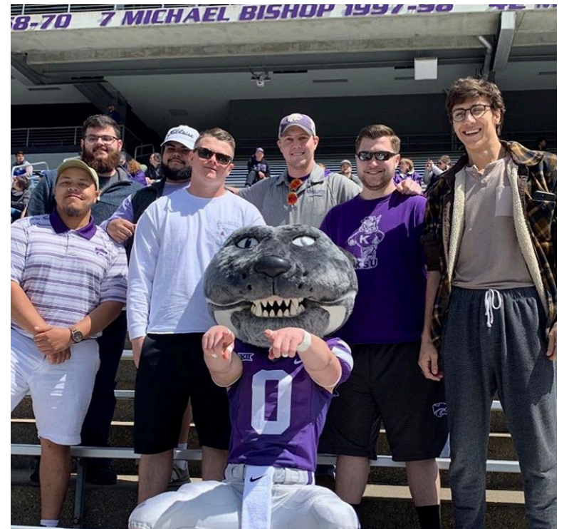
(Bottom Right) Iota Chapter at Kansas State University enjoy the University's Spring Game.