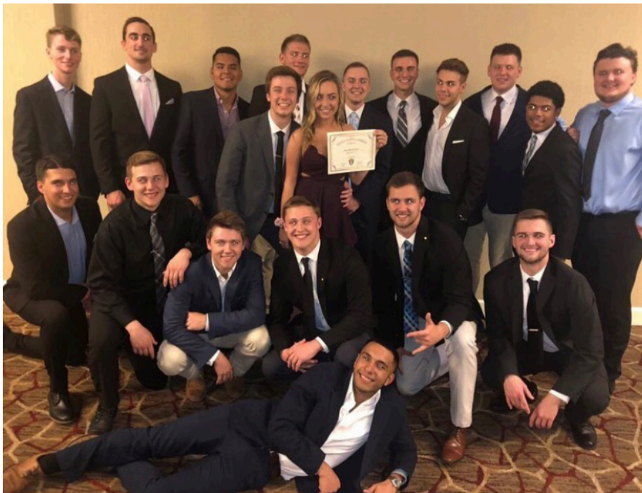
(Bottom Right) Gamma Theta brothers from Boise State University at their spring formal.