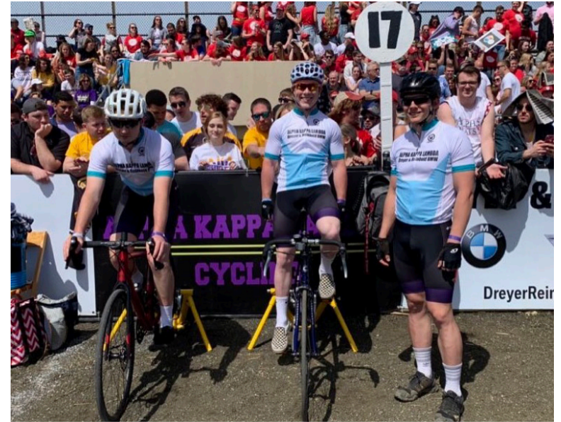
(Top Right) Gamma Tau Chapter at Indiana University compete in the University's "Little 500."