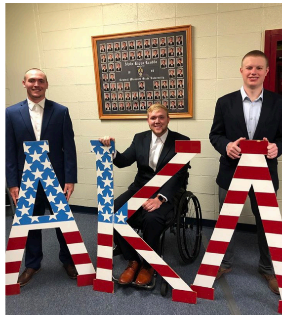
(Bottom Left) Sigma Chapter at the University of Central Missouri welcome their three newest members. Alethia Kai Logos!