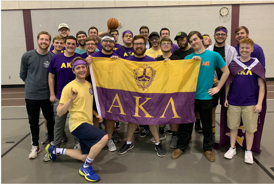
(Top Left) Lambda Chapter after Emporia State University's Greek Week Basketball Tournament Event.