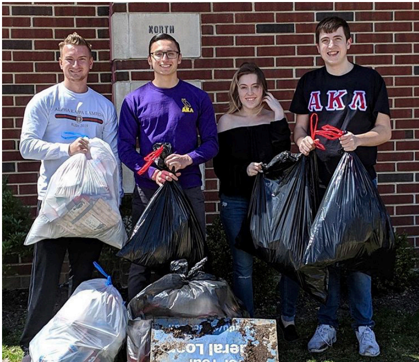
(Top Left) Gamma Lambda Chapter at Temple University host a food drive with the women of Delta Zeta.