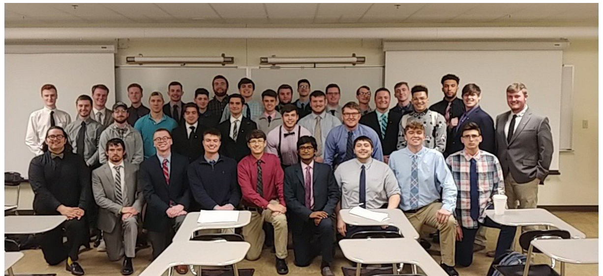
(Bottom Right) Alpha Zeta Chapter at Northwest Missouri State University celebrated Founders' Day.