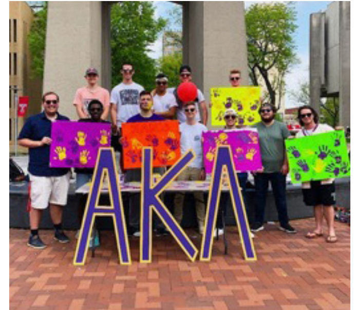
(Top Right) Gamma Lambda Chapter at Temple University finished the spring semester with a These Hands Don't Hurt event, raising awareness about sexual assault on college campuses.