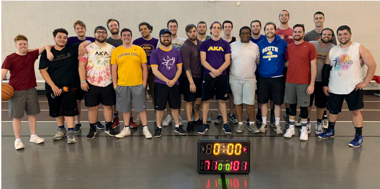
(Top Left) Lambda Chapter at Emporia State University hosted an alumni versus undergraduate dodgeball game. Congrats alumni on winning 101 – 72!