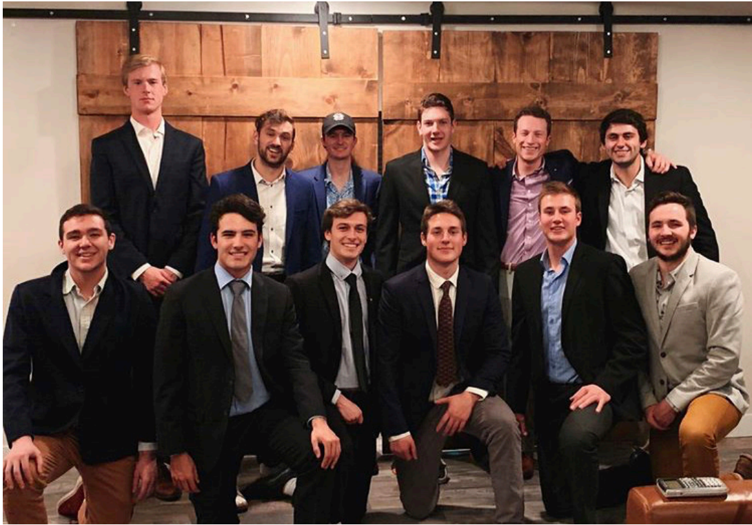
Top Left: The 2019 Executive Board (back row) of Alpha Omicron Chapter at the University of Colorado Boulder transitions in the newly elected officers (front row.)