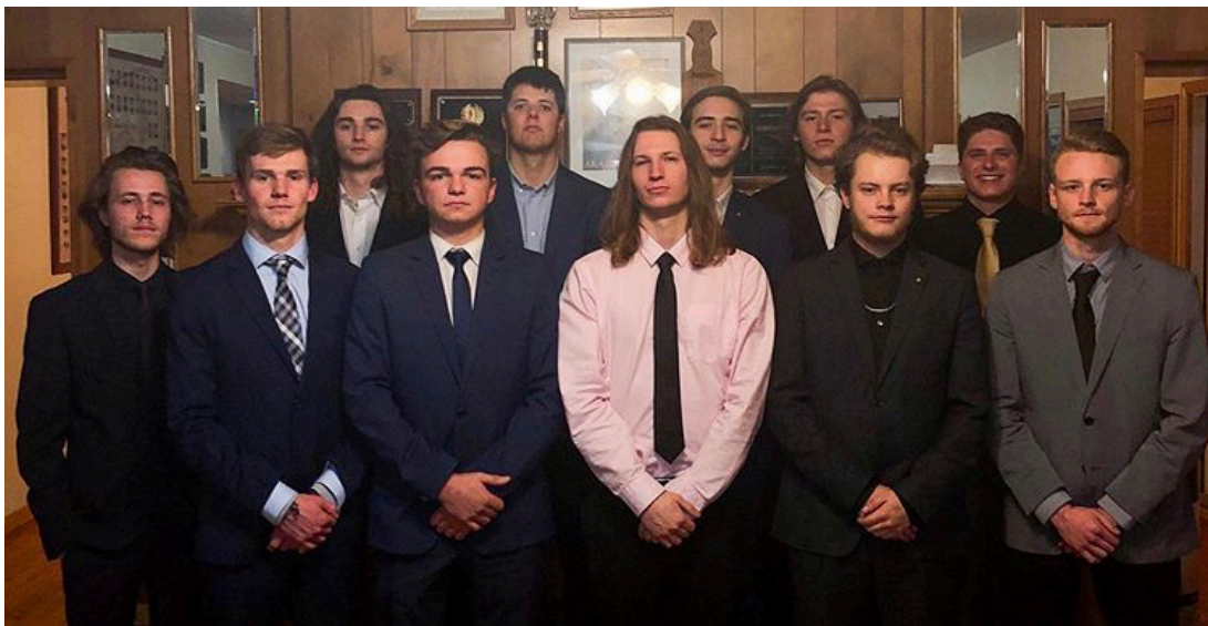
Bottom Right: Gamma Upsilon Chapter at Saginaw Valley State University celebrate their newly elected Executive Board with a chapter photo.