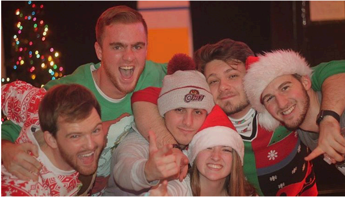
Top Left & Bottom Right: Gamma Lambda Chapter at Temple University held a holiday mixer with the women of Alpha Epsilon Phi.