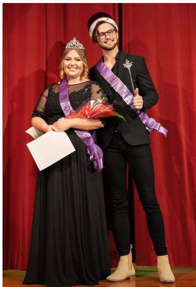
Below Right: Gamma Delta Chapter at the University of Montevallo support the women of Chi Omega's philanthropy 'Yippee Chi O' in support of Make-A-Wish.