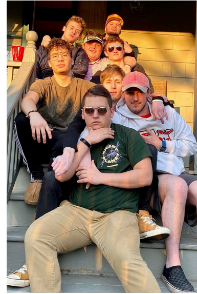
Above Right: Gamma Kappa Brothers at Fairleigh Dickinson University.