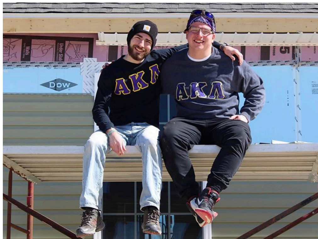
Above Left: Alpha Zeta Chapter at Northwest Missouri State University were #ForTheKids supporting St. Jude.