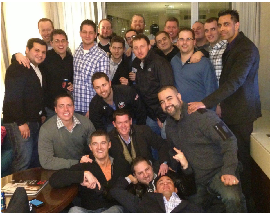
Keeping the tradition alive, both Alpha Lambda Chapter Alumni united for their annual Christmas get together downtown Chicago, 2012.

"Overall, USAID's mission is to partner to end extreme poverty and promote resilient, democratic societies while advancing our security and prosperity."