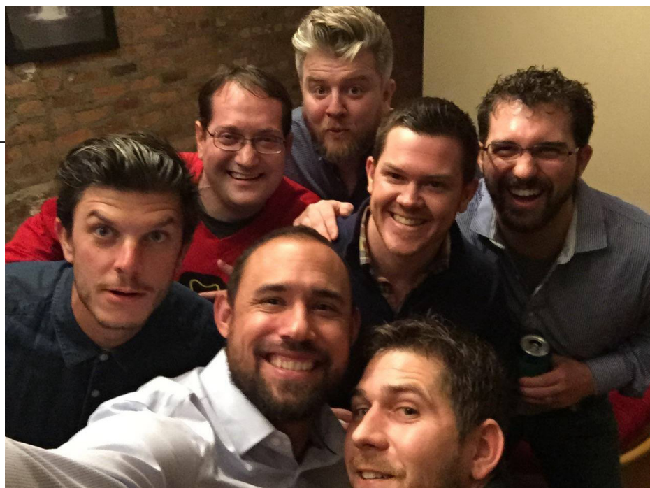
Alpha Lambda Chapter Alumni at their 2015 reunion.

"Maintain your integrity. I used to tell all of our new pledges "if you don't stand