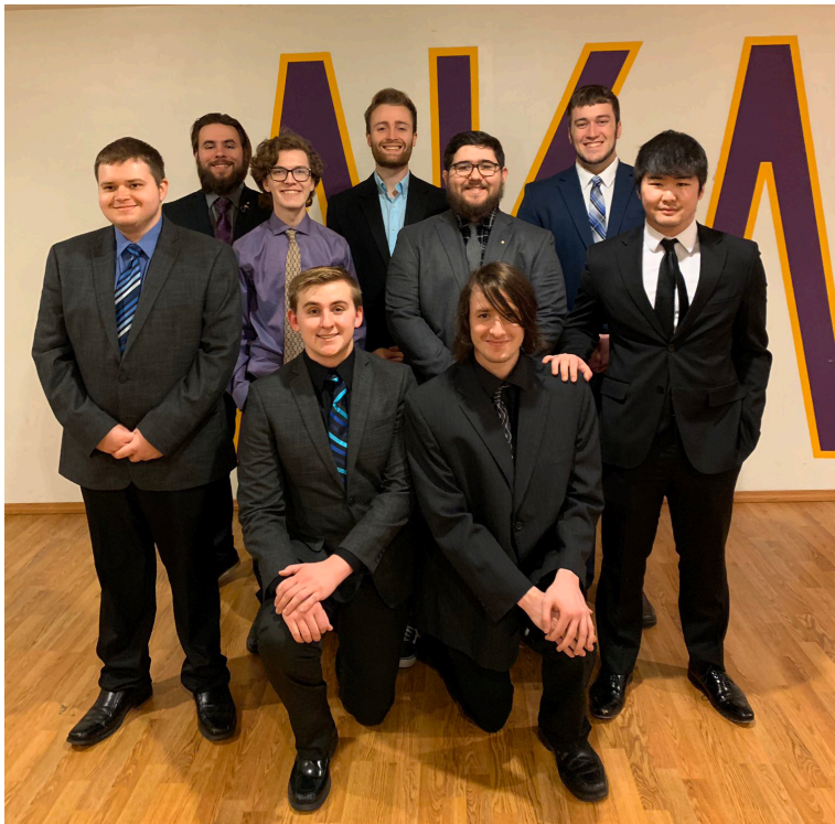
Below Right: Alpha Zeta Chapter at Northwest Missouri State University at their Yellow Rose Formal Dinner.