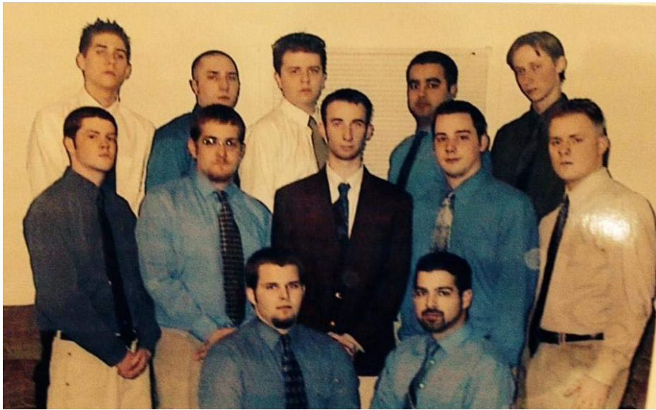
Alpha Lambda Colony Founding Fathers.

few months while researching how we could actually start a fraternity. We started getting more organized, holding weekly meetings and assigning colony officers."