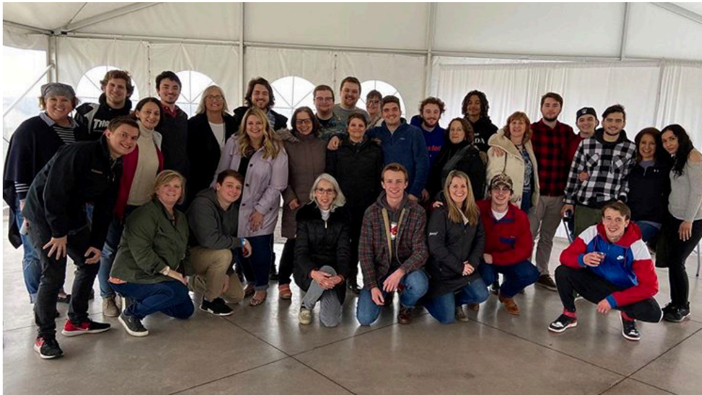
Above Left: Gamma Alpha Chapter at the University of Missouri celebrate family with an AKL Mom's weekend.