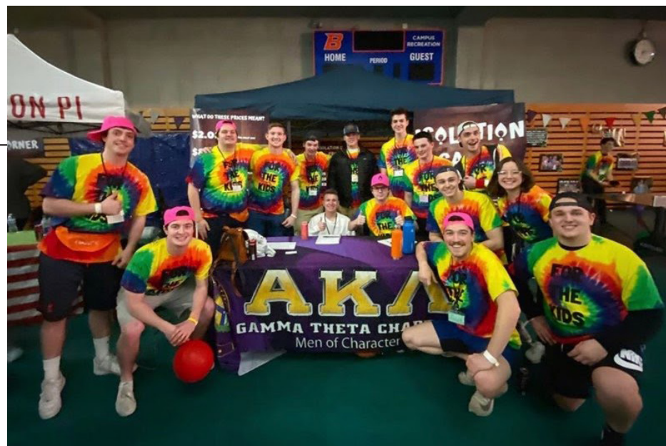
Gamma Theta Chapter Brothers at Boise State University's Dance Marathon.