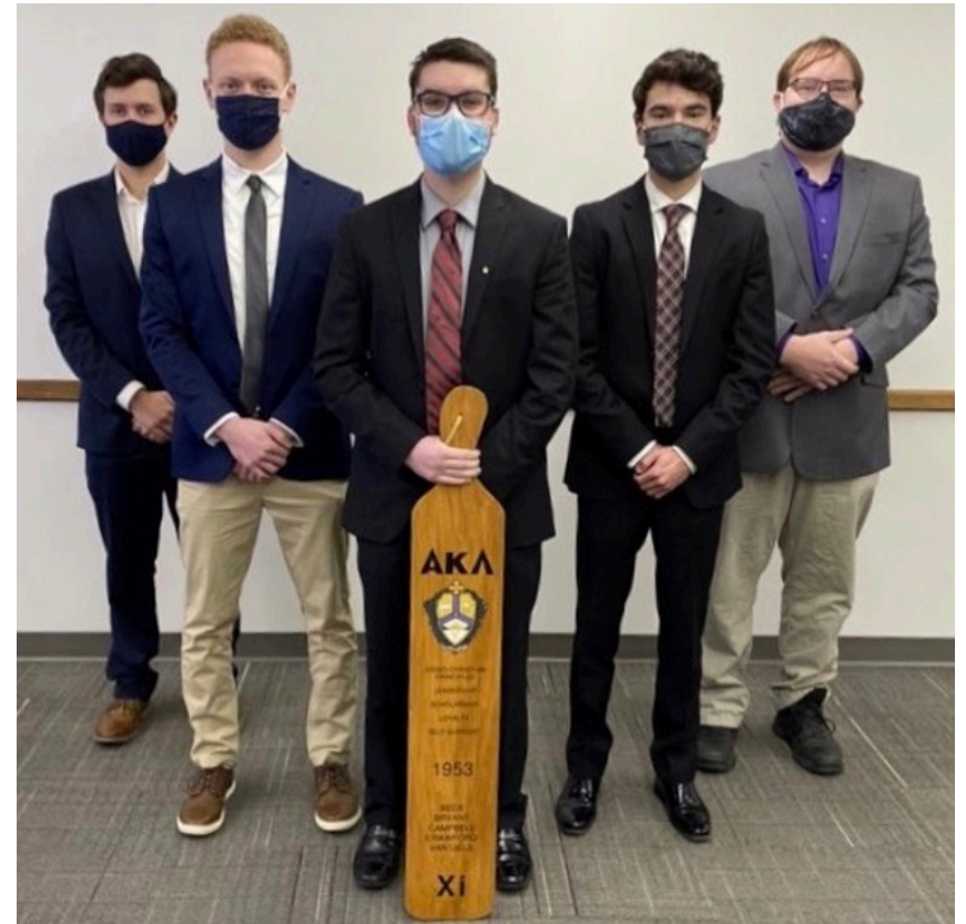
Top Right: Xi Chapter's Executive Board welcomes brothers, students, and faculty back to Truman State University! Masked up and ready to go, they're looking forward to a good semester and wish everyone luck on their classes!