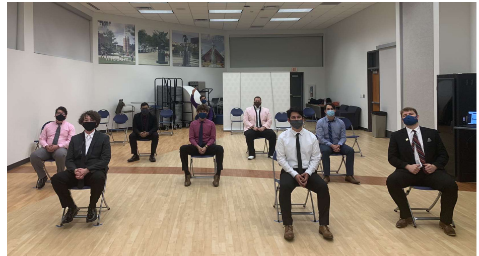
Gamma Upsilon chapter members practicing social distancing before Ritual & Initiation last semester in Fall 2020.