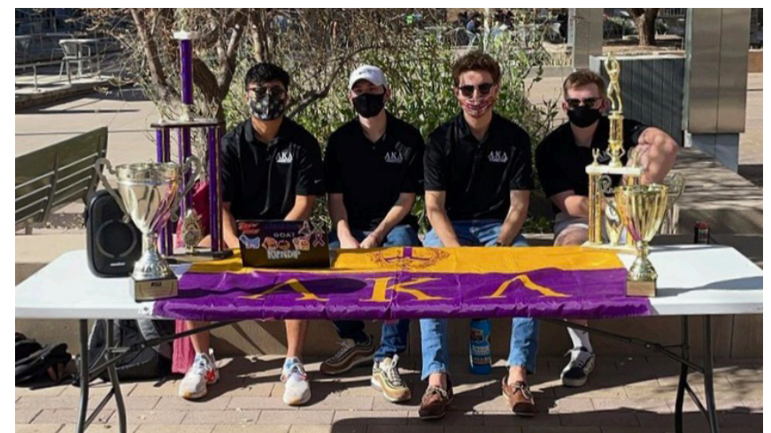
Bottom Right: Gamma Rho Chapter at Arizona State University tabled outside the Memorial Union for potential new members to come meet the brothers.