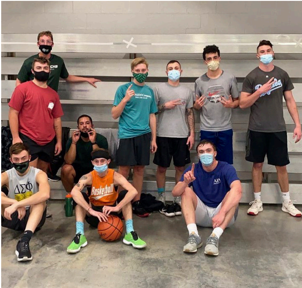
Top Left: Alpha Zeta Chapter brothers played some pick up ball and fostered Greek Unity with the men of Delta Sigma Phi at Northwest Missouri State University.