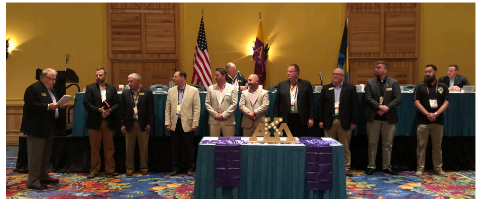
National Executive Council at the 2018 National Conclave at Atlantis, Bahamas

The chapter must not be on Financial Suspension.