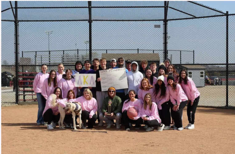
Left Middle- Sigma, Central Missouri, working with the women of Gamma Phi Beta to enjoy some Moonball.