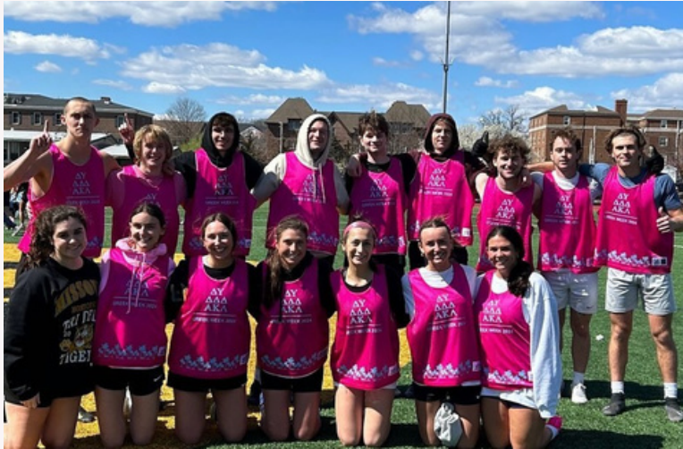
Left Top- Gamma Alpha, Missouri, participating in Greek Week alongside their team of Delta Delta Delta and Delta Upsilon.