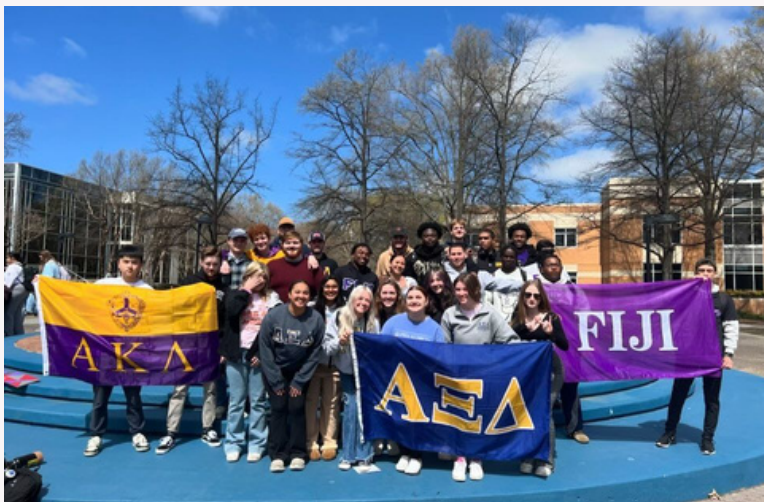
Left Bottom- Gamma Sigma, Old Dominion, enjoying Greek Week with their campus partners.