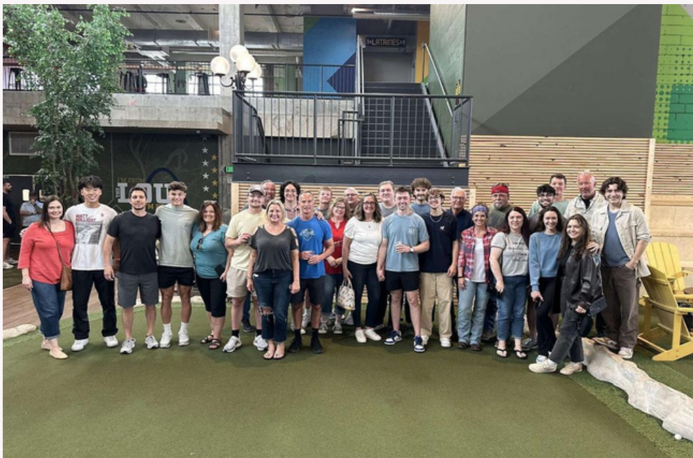
Bottom- Beta Tau, SIUE, celebrating with family during Parents' Day in St. Louis.