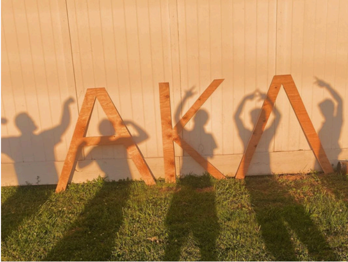
Top Left- Gamma Omicron, Dalton State, working hard together as brothers to create their new AKL letters!