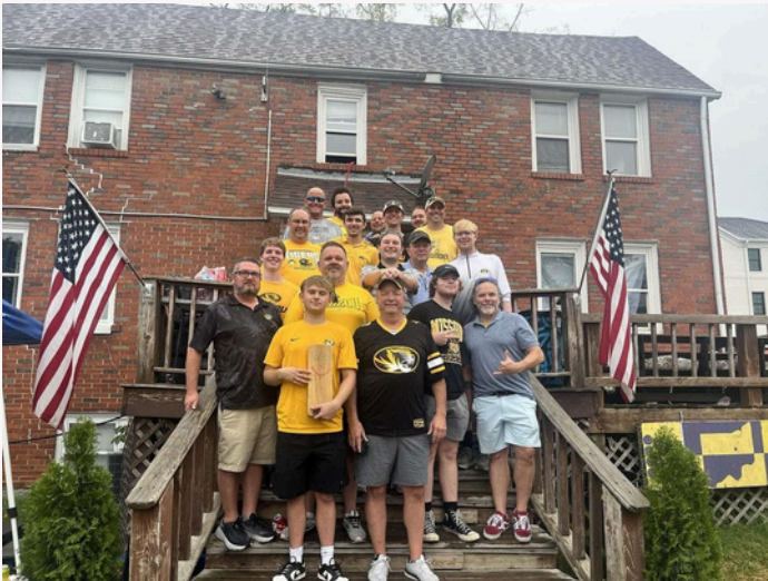
Bottom Right- Gamma Delta, Montevallo, enjoying their first brotherhood event of the semester with brothers and new members.