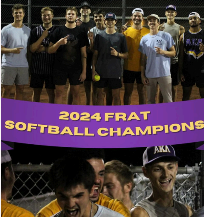
Top Left- Alpha Zeta, Northwest Missouri State University, enjoying their softball championship.