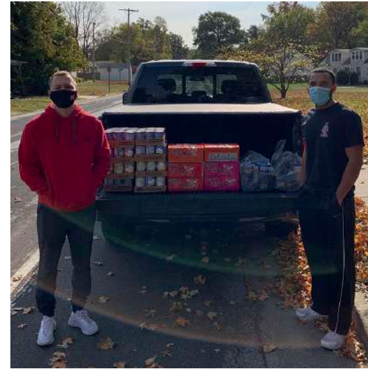
Top and Bottom Left: Kutztown Provisional Chapter hosted an outdoor food drive benefiting Helping Harvest Food Bank.