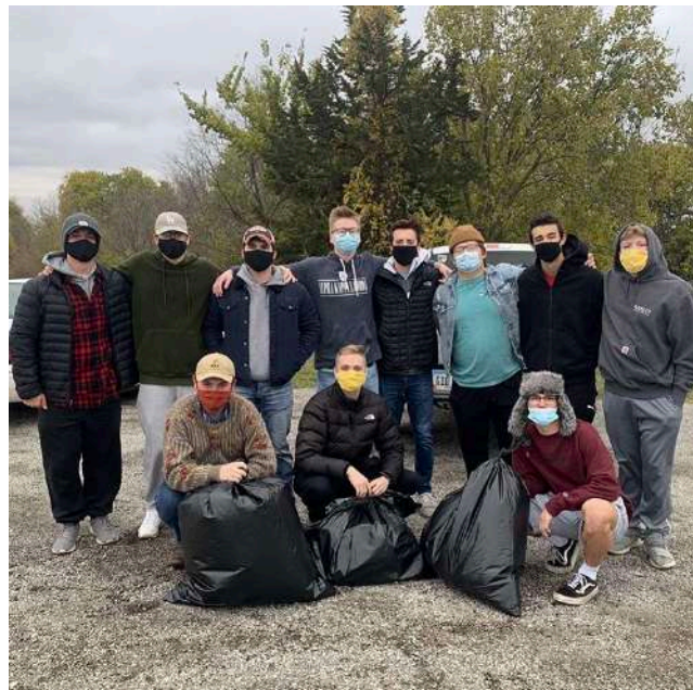
Bottom Right: Alpha Zeta Chapter volunteers their time with another cleanup, this time with a highway cleanup out in Maryville Missouri.