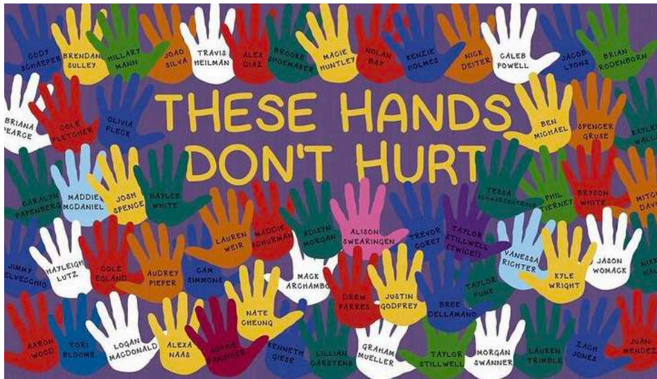
Top Right: Sigma Chapter at the University of Central Missouri hosted a physical These Hands Don't Hurt Promise Wall