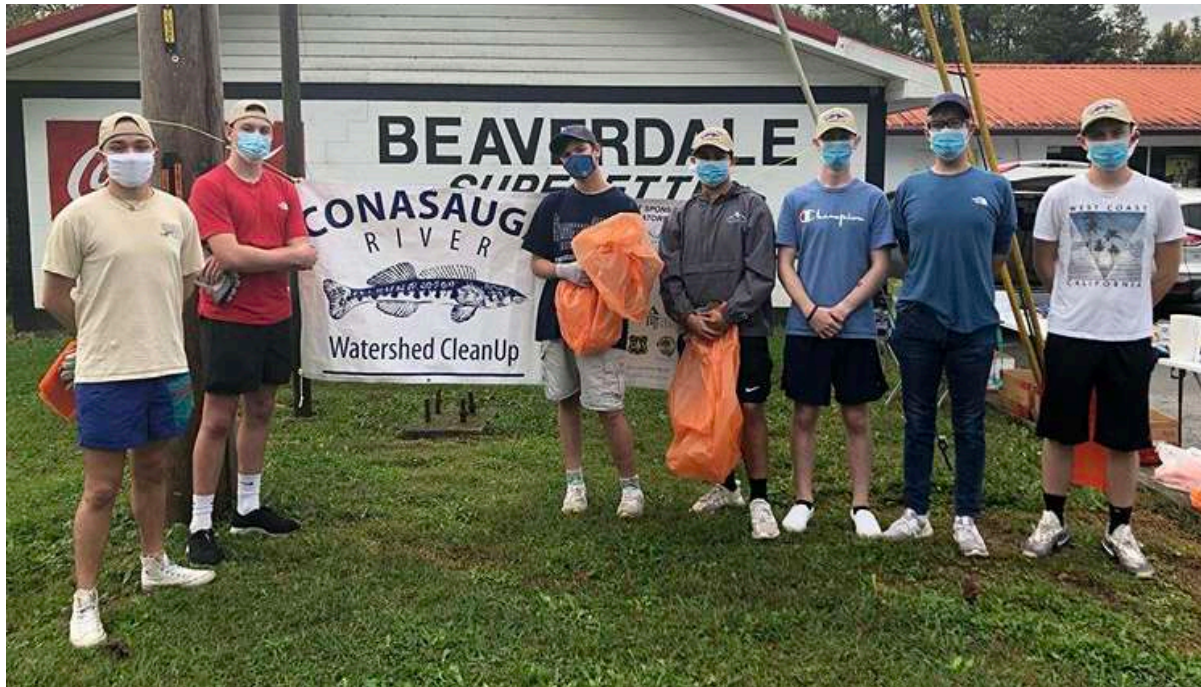
Top Left: Gamma Omicron Chapter at Dalton State College participated in the 25th Conasauga River Clean-Up.