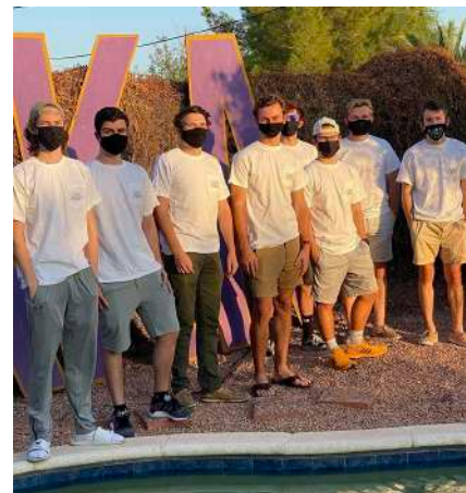
Top Left: Gamma Upsilon Chapter at Saginaw Valley State University tabling on campus.