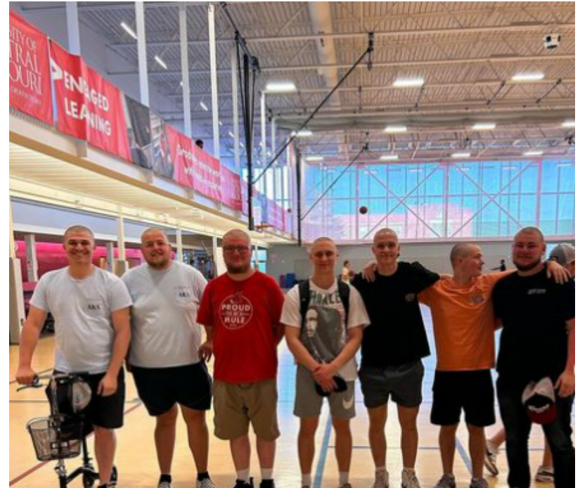
(Top Right) Sigma Chapter at the University of Central Missouri after a successful Alpha Kappa sLambda basketball tournament raising funds for St. Jude's Children's Hospital