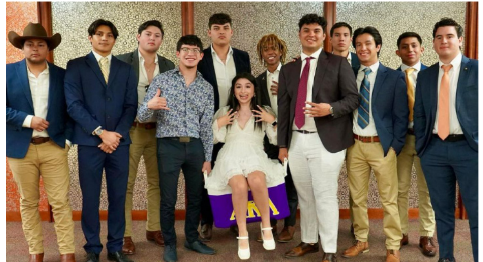
(Top) The Alpha Rho Chapter members and friends looking their best at the University of Texas- El Paso