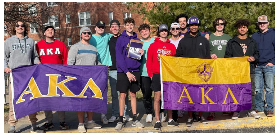
(Bottom) Beta Tau Chapter at Southern Illinois- Edwardsville celebrating their individual and chapter accomplishments at Spring Formal.