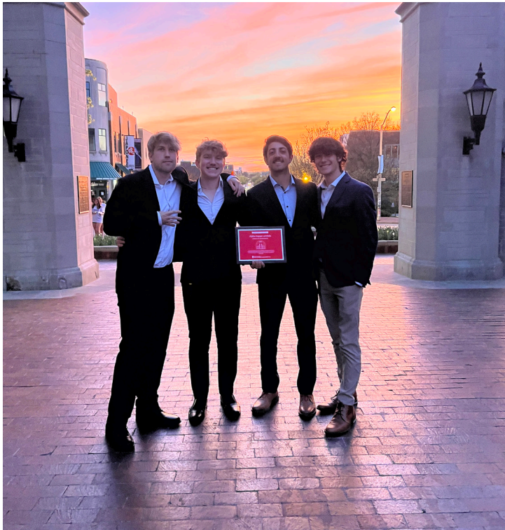
(Top) Gamma Tau Chapter at Indiana University enjoys being awarded the Chapter of Achievement at their Office of Sorority & Fraternity Life Awards Ceremony.