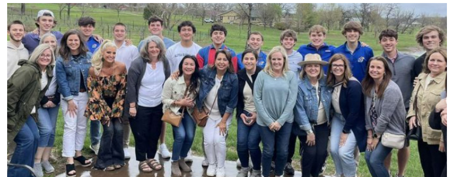
(Bottom Right) Delta Chapter at the University of Kansas after a successful Moms' Weekend.